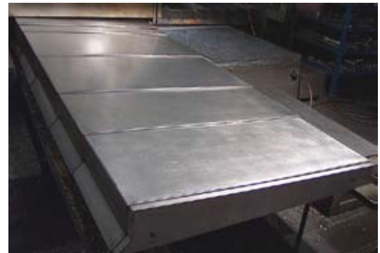
Repaired way cover reinstalled on machining center