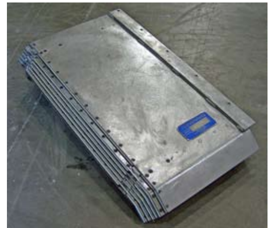
Way cover after repair and refurbishing by Hennig, Inc.